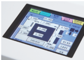
The large, color touch screen control module makes setting up the G2 quick and easy.