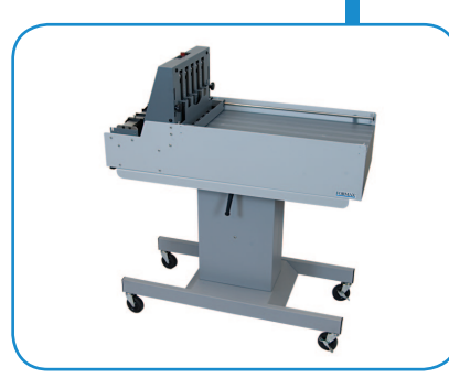
Optional V-Stack36 Vertical Stacker with adjustable-height stand