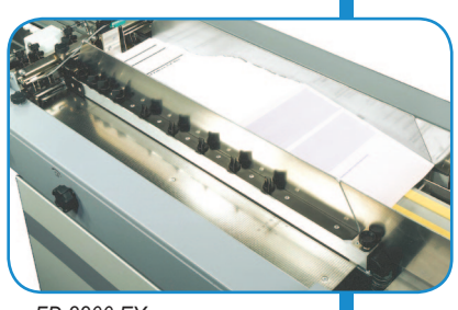
FD 2200 EX